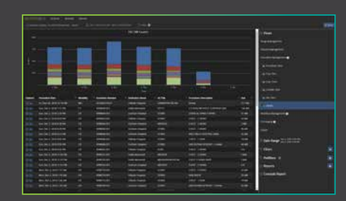
New Intuitive User Interface